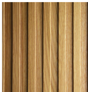
Knob oak Real wood veneer