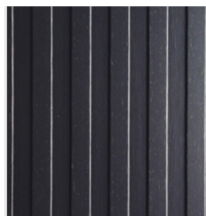
Black Alpi veneer