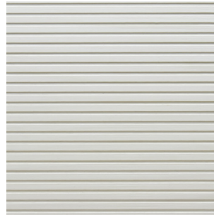
White Alpi veneer

Straightness: 3,0 mm per Meter Size accuracy: +/- 1,0 mm per Meter Thickness allowance: +/- 0,5 mm Exactitude of profile: +/- 1,5 mm