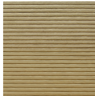
Knob Oak Real wood veneer