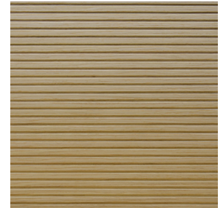
Light Oak Alpi veneer