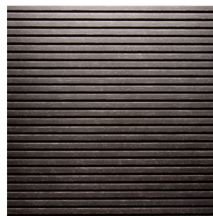
Black Alpi veneer