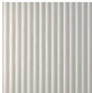
White Alpi veneer

Straightness: 3,0 mm per Meter Size accuracy: +/- 1,0 mm per Meter Thickness allowance: +/- 0,5 mm Exactitude of profile: +/- 1,5 mm