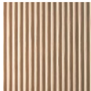
Light Oak Alpi veneer