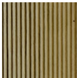
Knob oak Real wood veneer