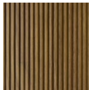
Heartwood walnut Real wood veneer