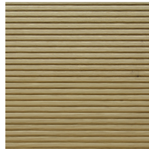
Knob oak Real wood veneer