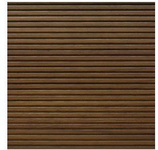
Heartwood walnut Real wood veneer