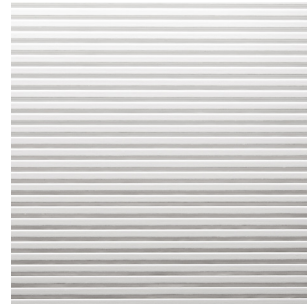
White Alpi veneer

Straightness: 3,0 mm per Meter Size accuracy: +/- 1,0 mm per Meter Thickness allowance: +/- 0,5 mm Exactitude of profile: +/- 1,5 mm