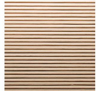
Light Oak Alpi veneer