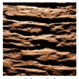
Oak smoked Real wood veneer

Thickness allowance: +/- 0,5 mm Exactitude of profile: +/- 1,5 mm