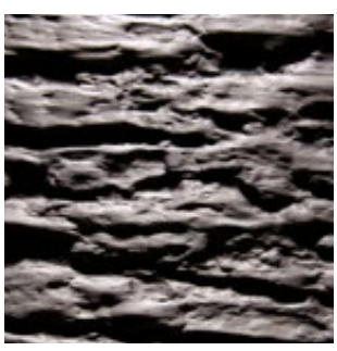
Oak grey Real wood veneer