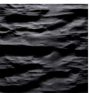
Black clear matt lacquered Alpi veneer