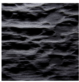
Black Ash optic lacquered Alpi veneer