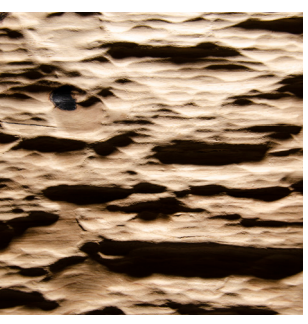
Oak rustic Real wood veneer

3,0 mm per Meter +/- 1,0 mm per Meter +/- 0,3 mm +/- 1,5 mm