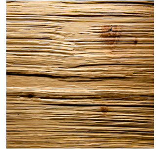
Spruce antique Real wood veneer