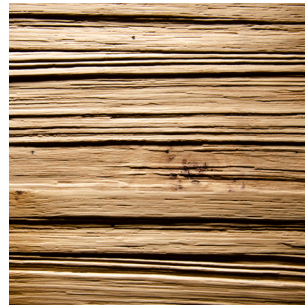
Rose Oak Real wood veneer

Straightness: 3,0 mm per Meter Size accuracy: +/- 1,0 mm per Meter Thickness allowance: +/- 0,5 mm Exactitude of profile: +/- 1,5 mm