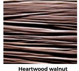
Real wood veneer