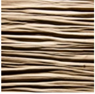
Real wood veneer