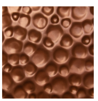
Bronze Real Metal